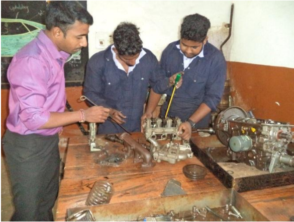
Automobile teacher guiding students in doing practical work.