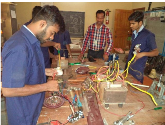
Electrician students doing practical work