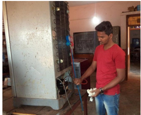
Refrigeration & Air Conditioning student doing practical work