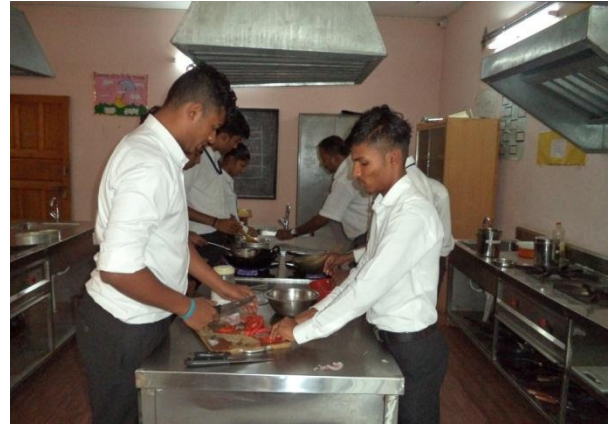
Hotel Management students are busy in doing practical work