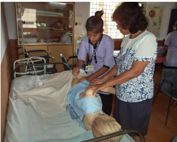
Home Nursing student with teacher in practical lab