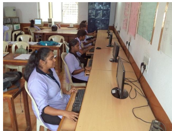
Computer students are busy in doing practical work