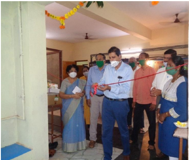
Inauguration of Electrician Practical Lab