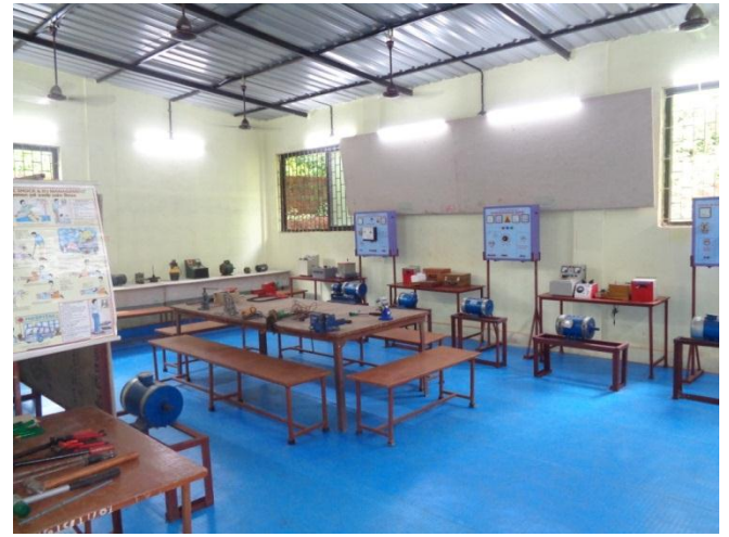
A view of new practical lab of electrician trade at Holy Cross Indo German Techno Centre