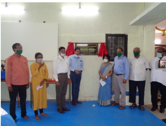
After inauguration of Electrician Practical Lab