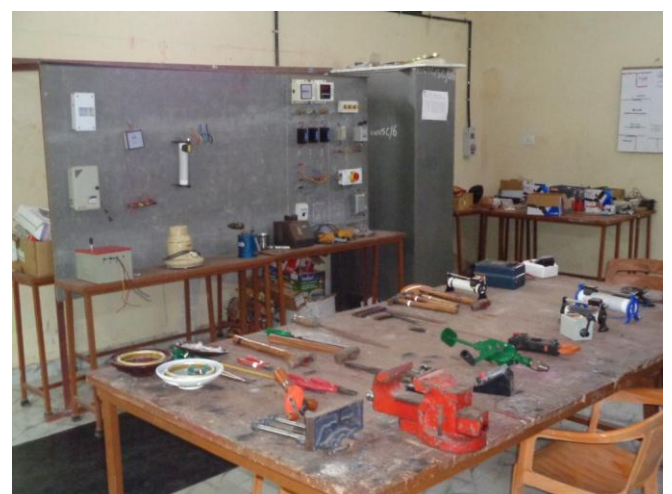
Well-equipped electrician practical lab